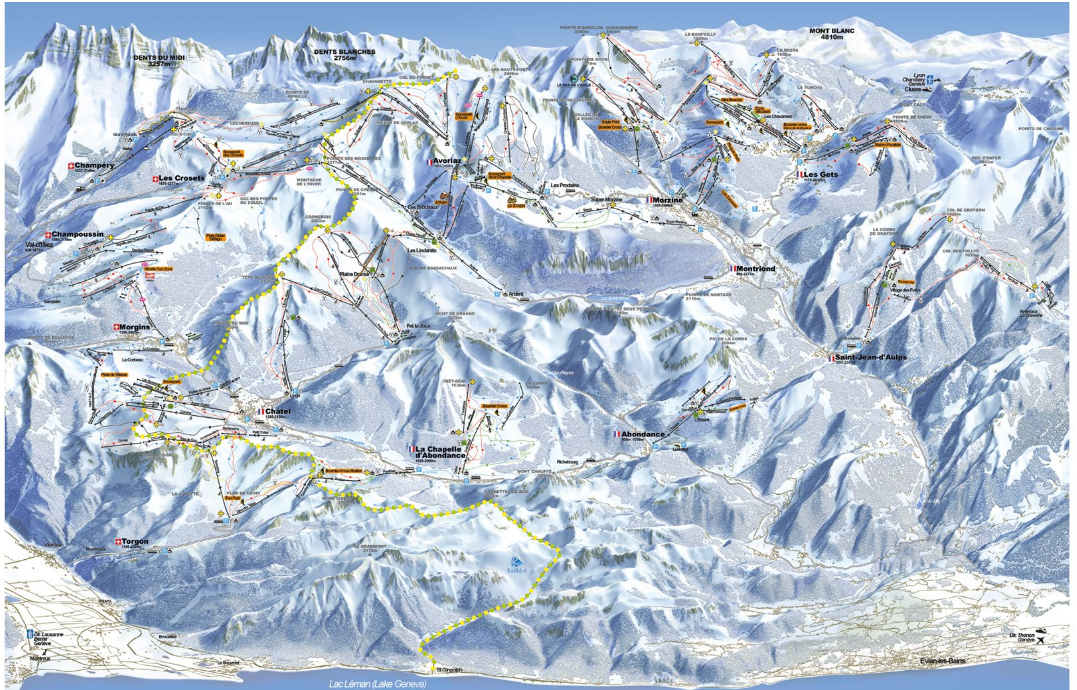
Lac Léman (Lake Geneva)