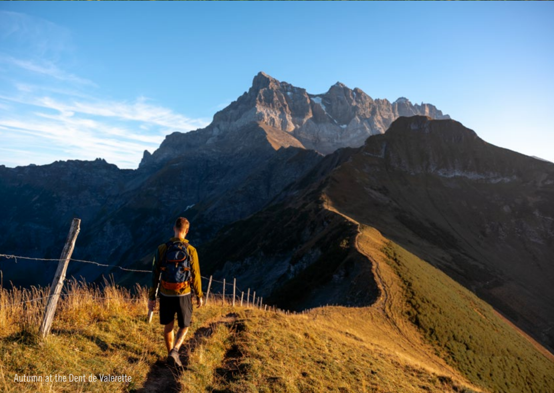
Autumn at the Dent de Valerette