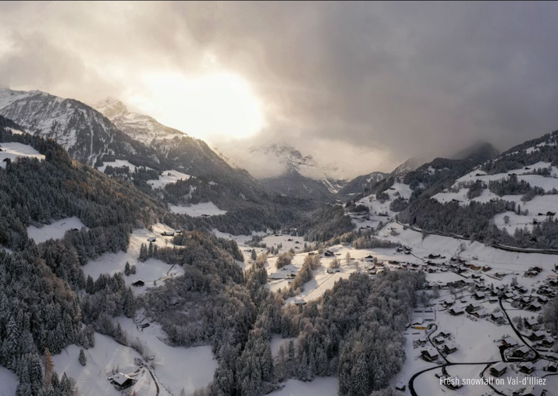
Fresh snowfall on Val-d'Illiez