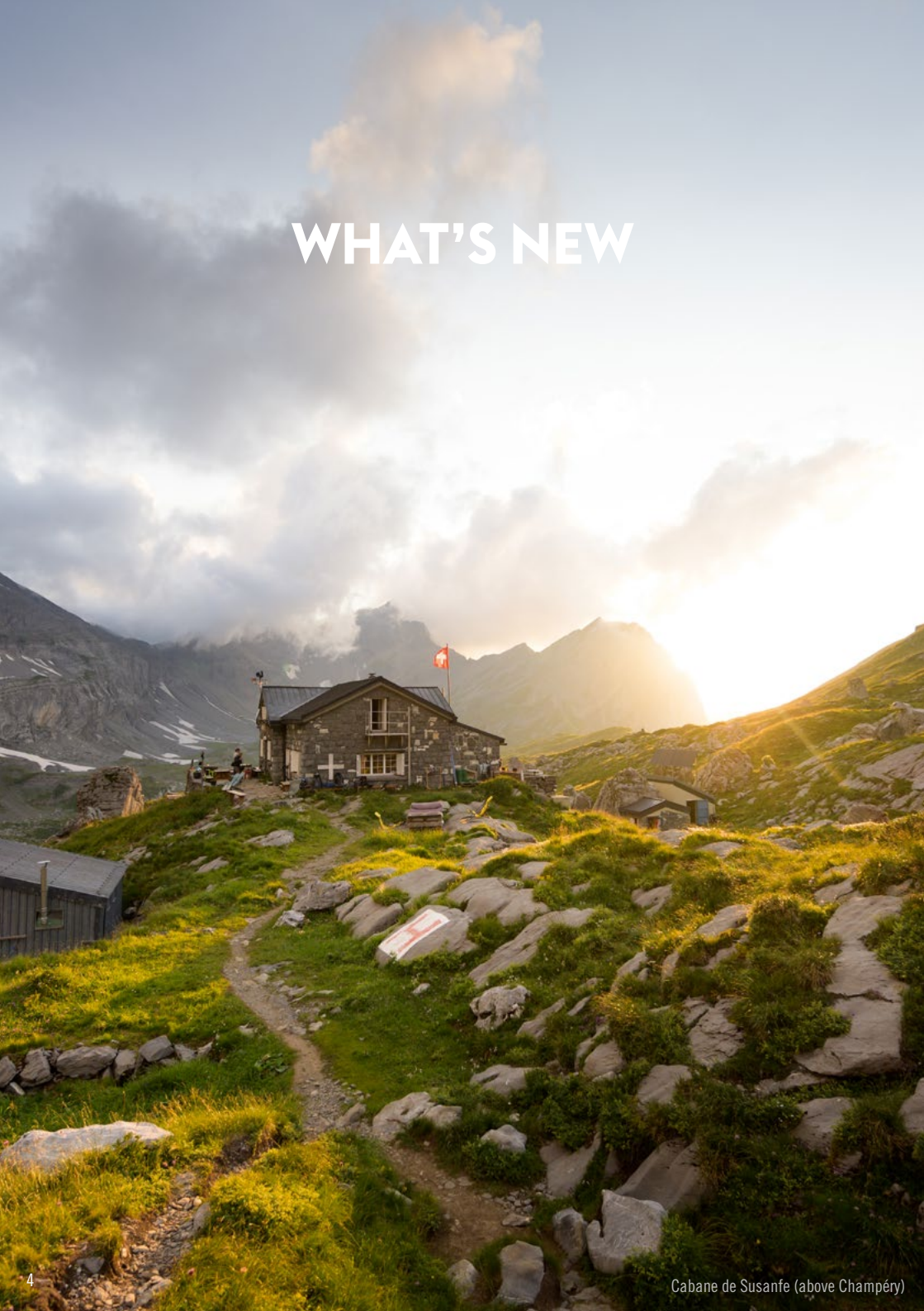
Cabane de Susanfe (above Champéry)