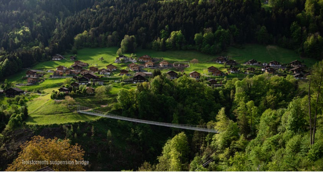
Troistorrents suspension bridge