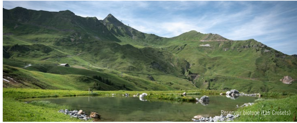
Reservoir biotope (Les Crosets)

The lifts will be open continuously from June 28 to August 25, 2024. After this date, please check the opening hours at portesdusoleil.com .