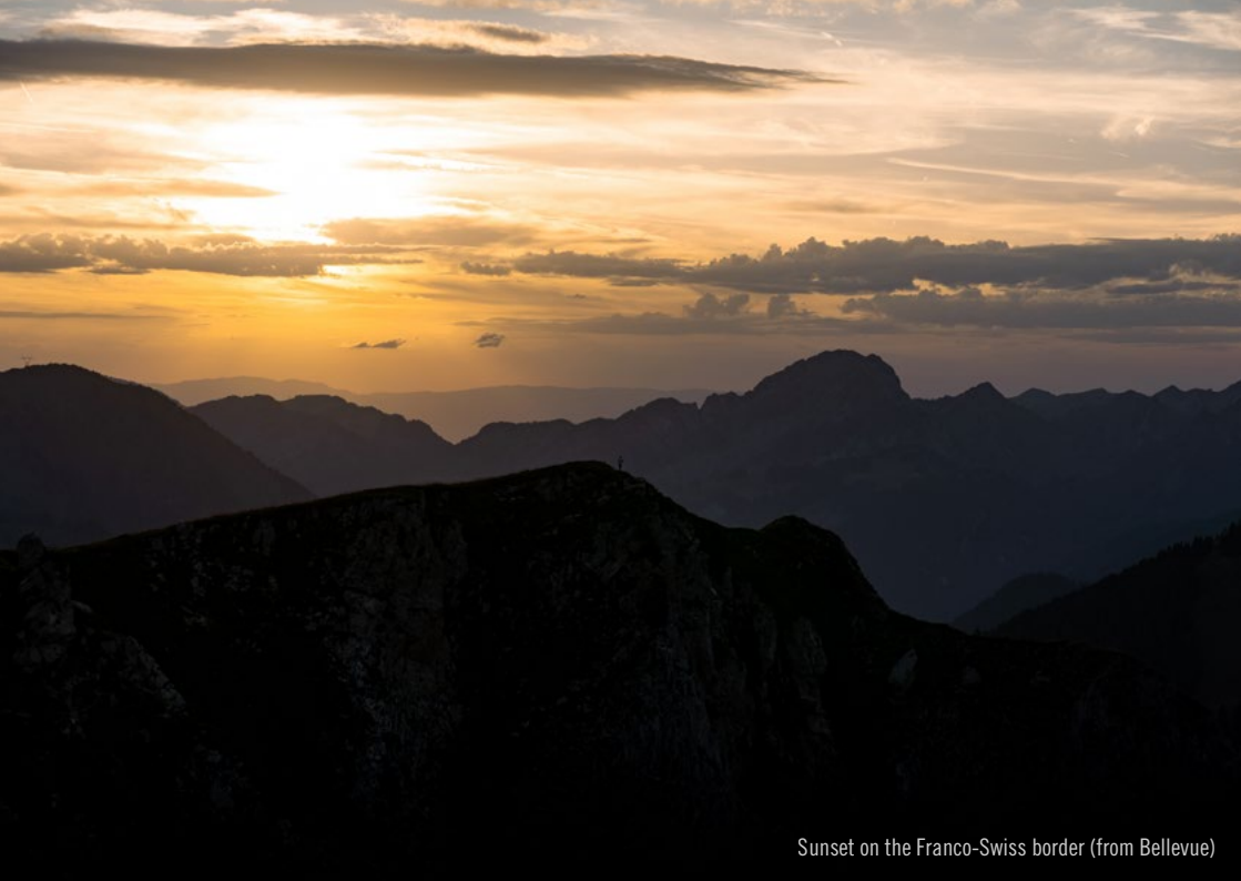
Sunset on the Franco-Swiss border (from Bellevue)